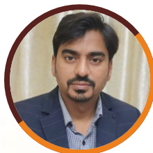
Dr. Rajendra Prasad